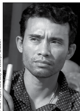
Photo from the documentary film The Flute Player